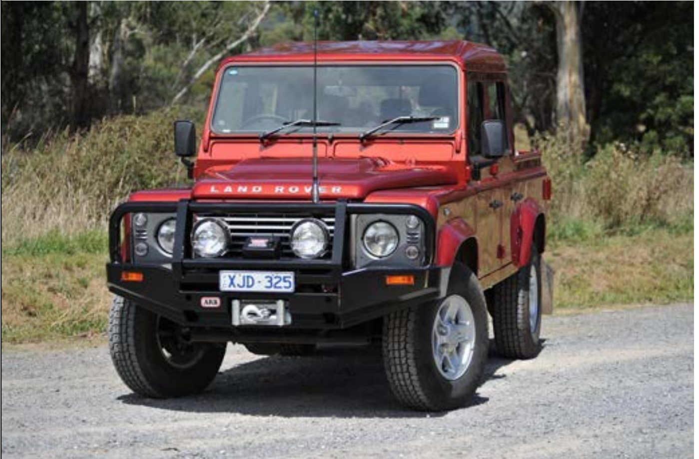
Winch Bumper fitted to vehicle